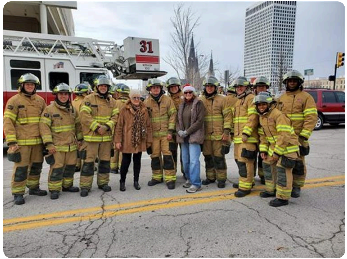
Tulsa Christmas parade 2019