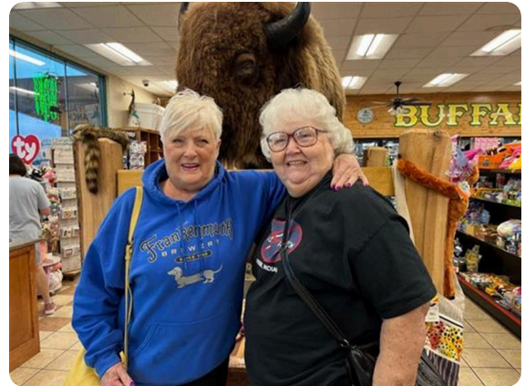
V8 Road trip 2022