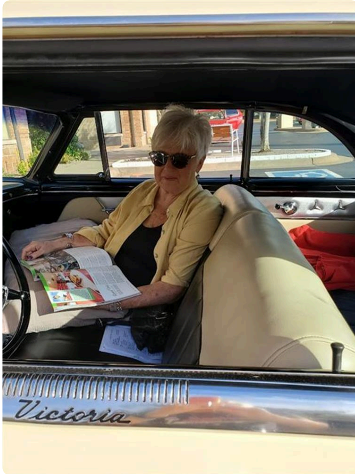
V8 road trip to OKC October 2023

Joan Denney shared 5 photos to the V8 Club memories of Jane album. January 4 at 9:17 AM