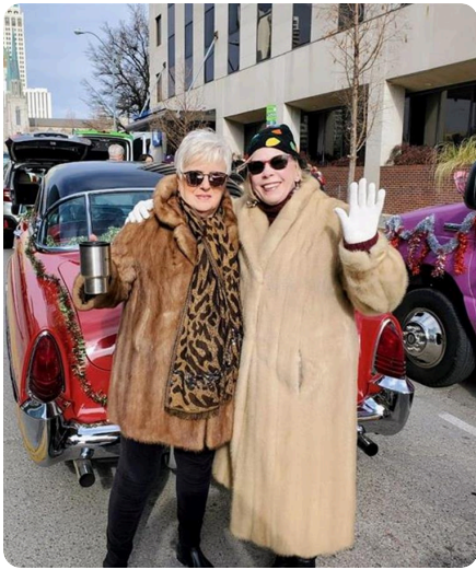
Tulsa Christmas parade 2019