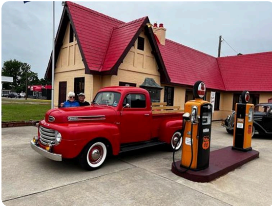
Kansas V8 road trip 2022